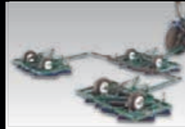
17' brushing width with the triple gang Greens Groomer 17.