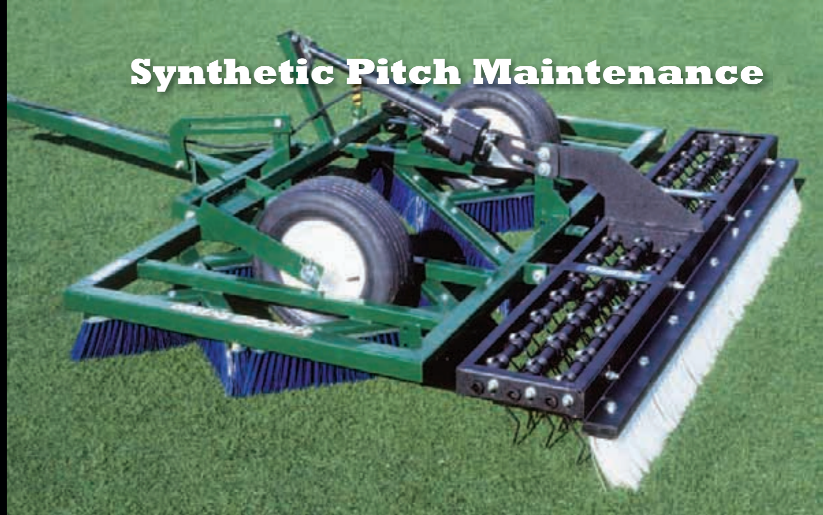
Greens Groomer with Rear Rake and Brush for rubber crumb filled pitches.