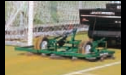
Greens Groomer brush only on a sand filled pitch.

The Greens Groomer on its own is ideal for traditional Sand-Filled Synthetic pitches. However, for the latest Rubber Crumb filled pitches, the new Rear Rake and Brush attachment uses no less than 84 spring fingers mounted in three staggered rows to totally groom your pitch. And each row of rakes is adjustable, so you can vary their intensity from just a gentle combing to a thorough raking.