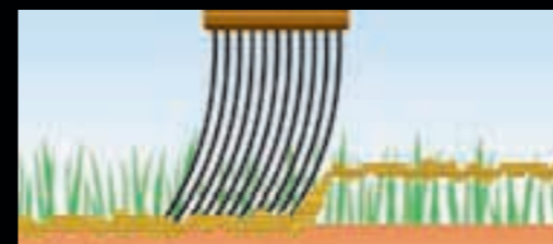
The Greens Groomer works the sand down into the surface between the blades of grass.