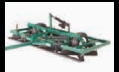
Front mounted clay pitch scarifier.