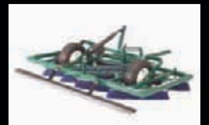
Rear mounted clay pitch rake.