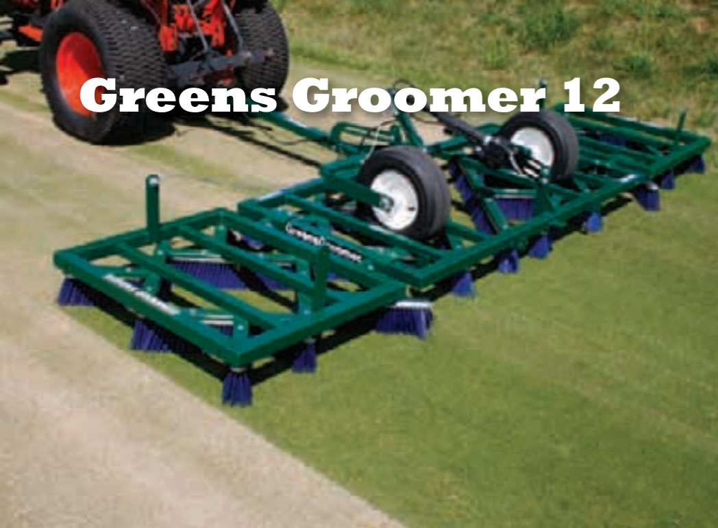
Brushing-in topdressing in a single pass.