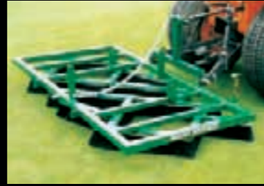
3 point mounted version for use with compact tractors.

If you are already using a Greens Groomer 6, why not fit the 12' upgrade kit and double your productivity?