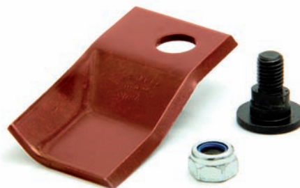
LazerBladez™ fling-tip blade, blade bolt and self-locking nut.

Trimax has engineered the ProCutS3 to be a user friendly mower with low maintenance requirements. Its strong monocoque construction eliminates moisture traps while proven mechanical components minimise potential downtime. Roller bearings are mounted inboard for better protection and remote grease points allow for quick and easy lubrication of spindles and bearings.