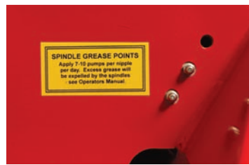
Remote grease points for hassle-free lubrication and maintenance.

Easy access cut-height setting is infinitely variable.