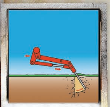
Verti-Drains adjustable parallelogram design shatters the soil, and also allows for clean Coring, on all models.

This machine is equipped with maintenance free, self lubricated sealed bearings on all pivot points. This saves the operator hours of greasing.