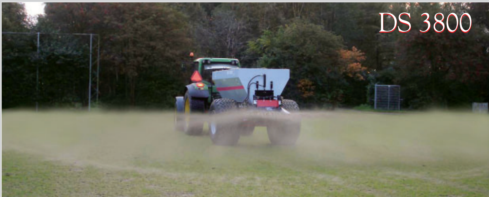
The DS 3800 spreads the material up to 15m (6½ ft) wide