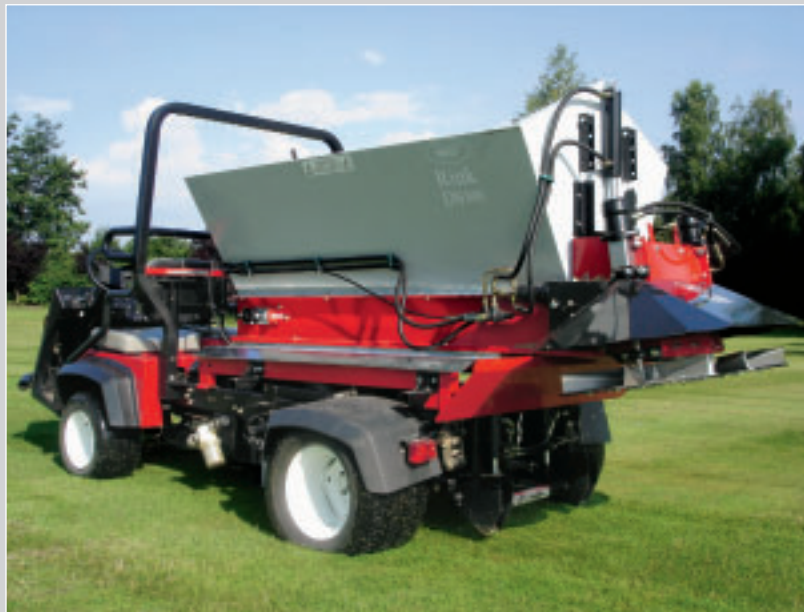
The Rink DS 800 can be carried either on top of the utility vehicle (above) or be pulled (below)