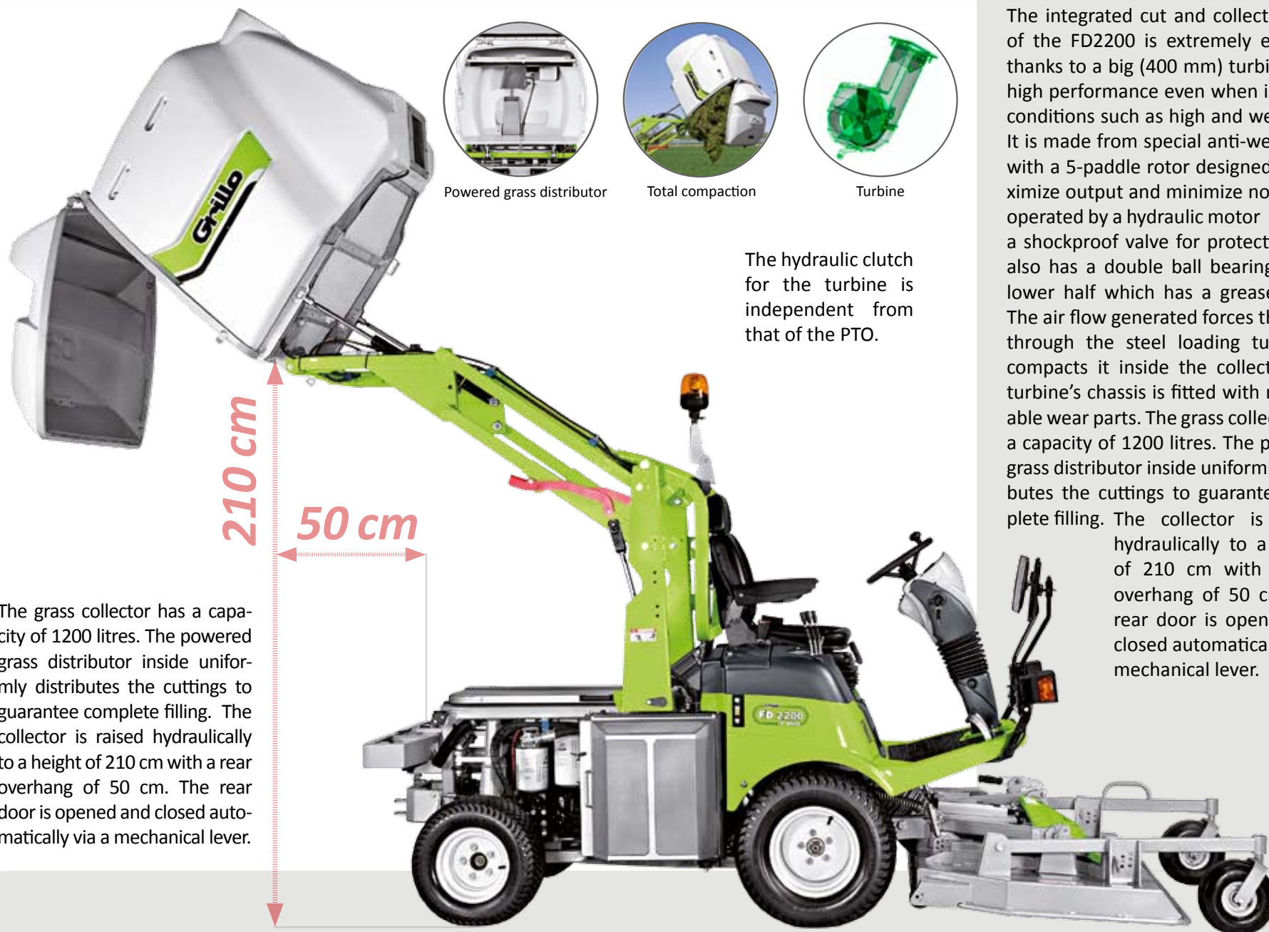
Powered grass distributor